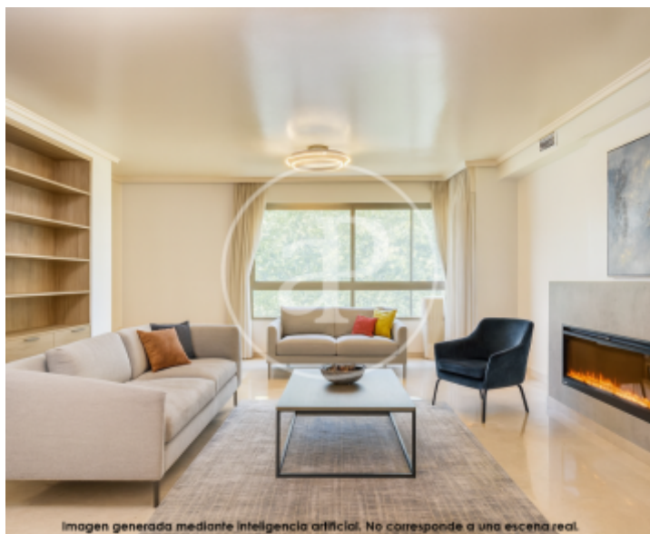
Imagen generada mediante inteligencia artificial. No corresponde a una escena real.