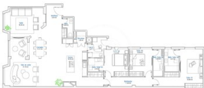
83. Estado reformado (2)