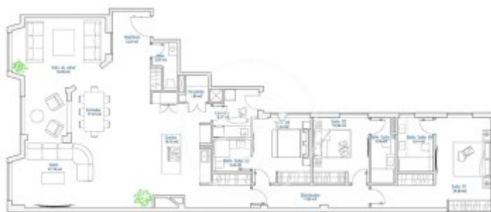
83. Estado reformado (1)

The information about any property is not binding to any offer or contract. Any verbal or written declaration made by aProperties with regards to the value or condition of the property should not be considered accurate or factual. The pictures make reference to some parts of the property at the times that they were taken. The areas, dimensions and distances that are given are approximate and should be checked by the client. The images are computer generated and are just an approximate indication of the real appearance of the property; these may change at any time. The information with regards to the property may also change at any time.