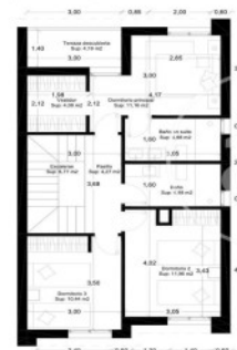
COTAS Y SUPERFICIES Planta 1ª | Vivienda Tipo