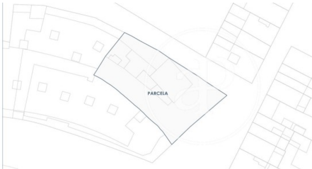
CUADRO URBANÍSTICO DE PARCELA (PGOU-98)