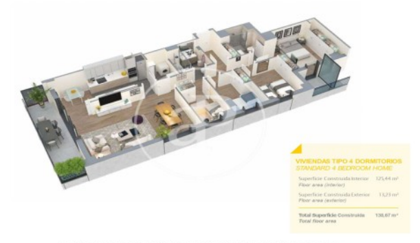
"Plano informativo, susceptible de ser modificado por necesidades técnicas o de arquitectura, Superficies orientativos. Is floor stan is fir illustrative purposes onte and may be subject to change for technical or architectural reasons. Floor areas are for guidance only.