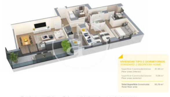
"Plano informative, susceptible de ser modificado por necesidades tecnicas o de anguñectura. Superficies orientatives. Toor plan is for illustrative purposes only and may be subject to change for technical or architectural reasons. Ploor areas are for guidance on

The information about any property is not binding to any offer or contract. Any verbal or written declaration made by aProperties with regards to the value or condition of the property should not be considered accurate or factual. The pictures make reference to some parts of the property at the times that they were taken. The areas, dimensions and distances that are given are approximate and should be checked by the client. The images are computer generated and are just an approximate indication of the real appearance of the property; these may change at any time. The information with regards to the property may also change at any time.