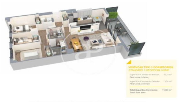
*Plano informative, susceptible de ver modificado por necesidades técnicas o de arquitectura. Superficies orientatives. *This floor plan is for illustrative purposes only and may be subject to change for technical or architectural reasons. Floor areas are for guidance only.