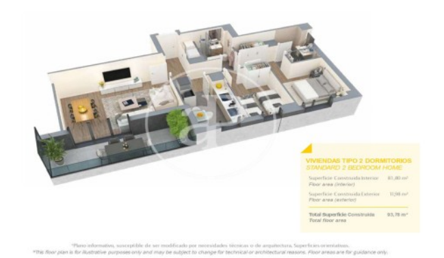
The information about any property is not binding to any offer or contract. Any verbal or written declaration made by aProperties with regards to the value or condition of the property should not be considered accurate or factual. The pictures make reference to some parts of the property at the times that they were taken. The areas, dimensions and distances that are given are approximate and should be checked by the client. The images are computer generated and are just an approximate indication of the real appearance of the property; these may change at any time. The information with regards to the property may also change at any time.